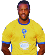
ADE BATULA SPONSORED BY: