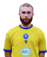
CHESTER CLOTHIER SPONSORED BY: